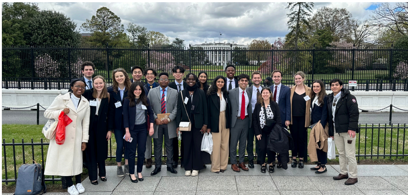
Policy & Global Governance Trek to Washington D.C. (read more in the "Career Treks" section)